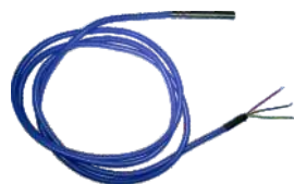
1Wire® temperature sensor