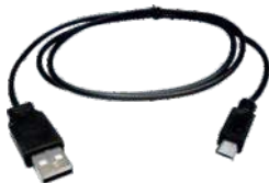
USB to micro USB cable